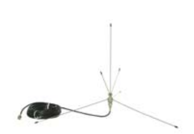
LA-107 Ground Plane Remote Antenna (216 MHz)