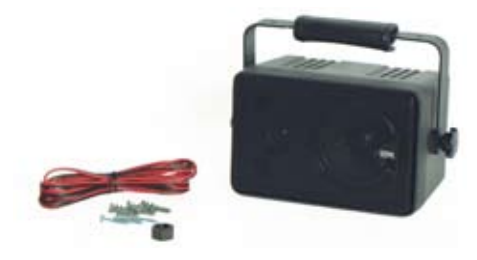
LA-316 Expansion Speaker for LR-600 and LR-100