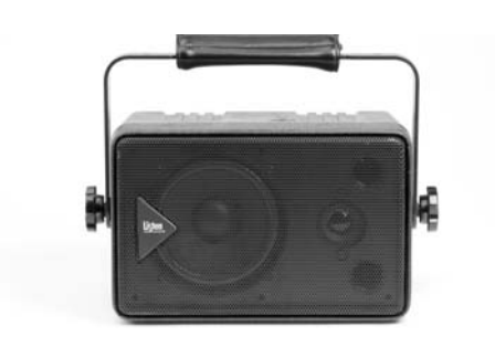
LA-316 Expansion Speaker